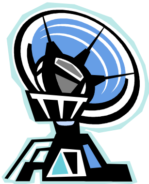
COMPUTERS (MATH&READING) SKILLS